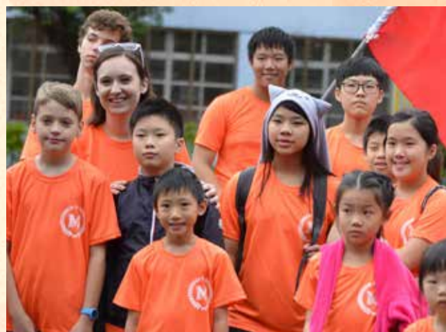
The Taipei Campus held its Olympic Day on November 3rd. The cooler weather, however, did not dampen the students' enthusiasm! 台北校區於11月3日舉行了奧運日。然而，涼爽的天氣並沒有減弱學生的熱情!