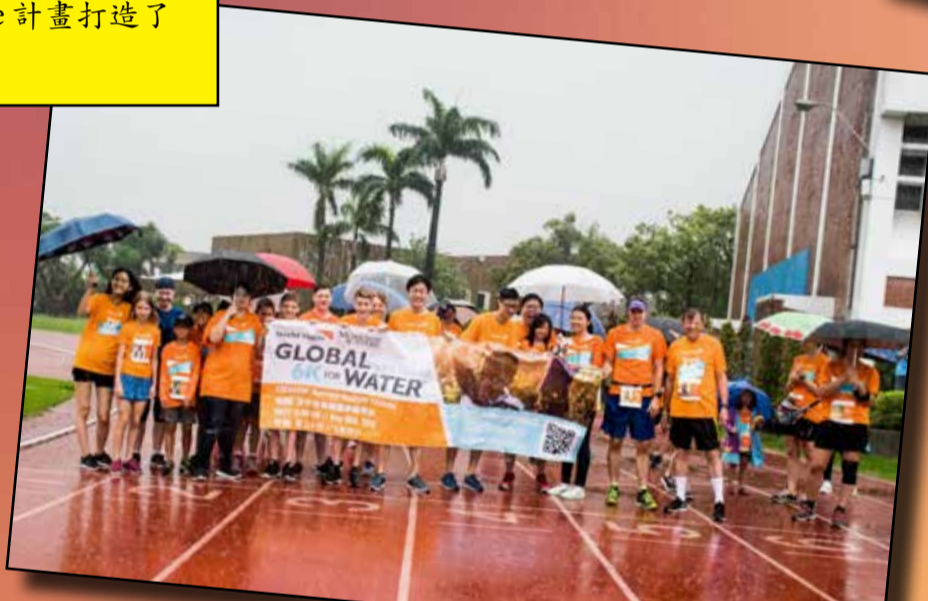
Snapshot from the "World Vision: Global 6K for Water" Capstone Project courtesy of Caitlin Lin (MAC). 由 Caitlin Lin (台中校區) 的 Capstone 計畫發起的「世界展望會——為水而跑」活動一瞥。