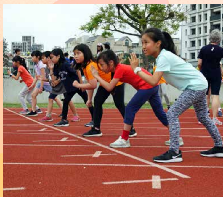
Chiayi students and teachers joined the Taichung Campus for their annual EMS Track and Field Day. As seen in these photos, smiles were plentiful. 嘉義校區的學生及老師特地北上到台中校區參加一年一度的中小學運動會。從這些照片中可以看出大家臉上都充滿著笑容。