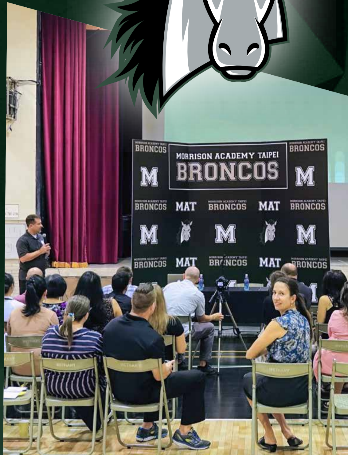
Pictures from the press conference held on May 15th where the new mascot logo was unveiled. 5月15日記者會上的吉祥物新面貌亮相。

To coincide with the January 2020 start at its new purpose-built campus and to mark the beginning of the next phase in the school's history, Morrison Academy Taipei has given the Broncos mascot logo an all-new look! The new mascot logo will go into official use beginning in August 2019.